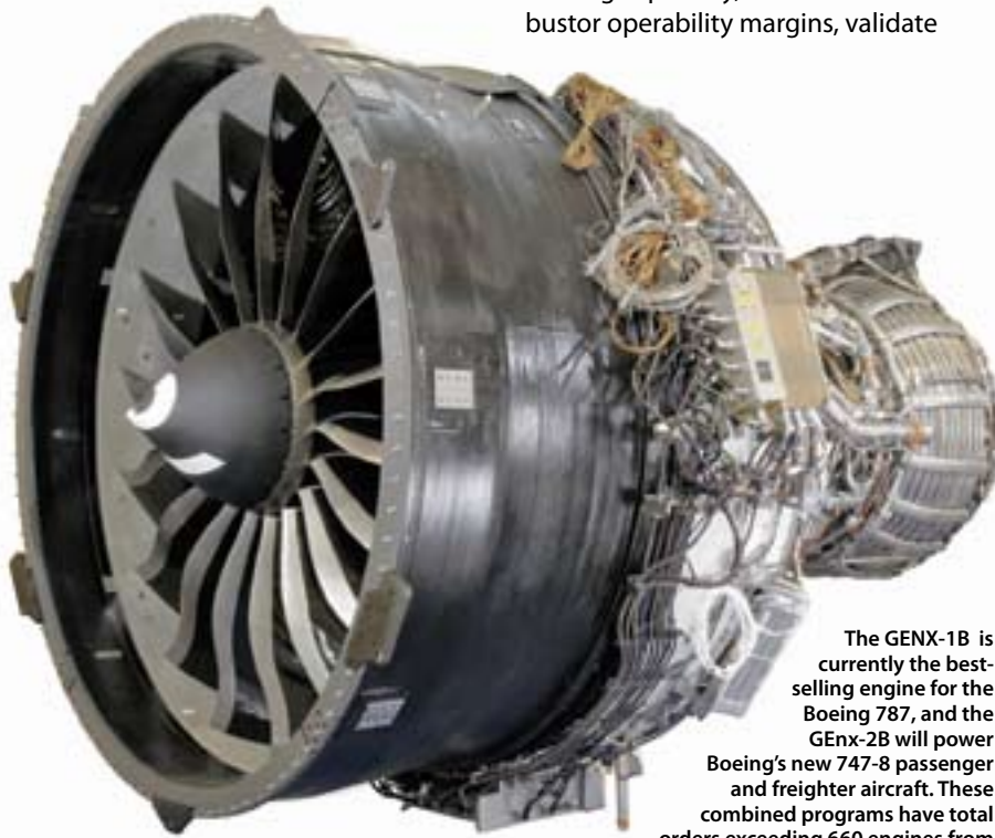
The GENX-1B is currently the best-selling engine for the Boeing 787, and the GENx-2B will power Boeing's new 747-8 passenger and freighter aircraft. These combined programs have total orders exceeding 660 engines from 22 customers.

Flight testing will continue at a rate of about three flights per week over the next couple months. The tests will evaluate the steady-state and transient performance of the engine, verify air re-starting capability, determine the combustor operability margins, validate