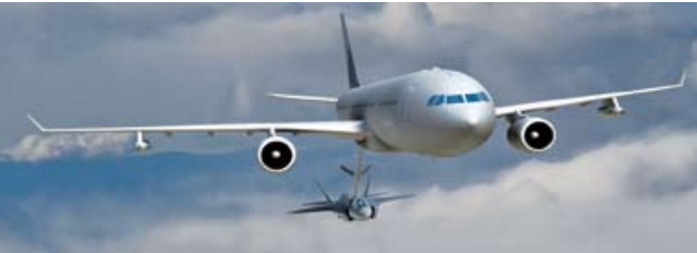
Northrop Grumman's KC-30 Tanker aircraft refuels an F-35 Joint Strike Fighter in this illustration. Northrop Grumman is offering the KC-30 with fly-by-wire controls to replace the U.S. Air Force's fleet of aging tanker aircraft.

91% during Operation Desert Storm in 1991, to an average of 78% during Operation Allied Force in 1999, to about 86.4% in Operation Iraqi Freedom in 2003. The rates not being 100% make it clear that it is not an issue of whether the USAF gets a new fleet of tankers, but when.