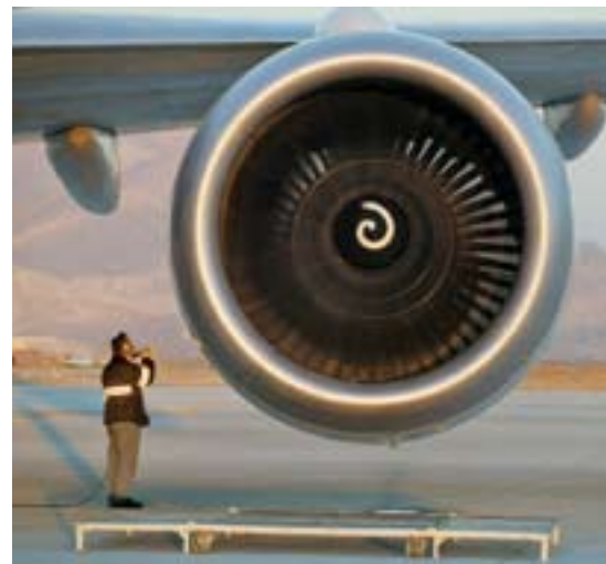
Because all of the combustion air of the GENx enters through the dome and mixers, no dilution holes are required on its new liner, reducing distress and resulting in a longer line life and reduced maintenance.

CF6, which powers many later 747 models, but the advantages of doing so was somewhat outweighed by disadvantages.