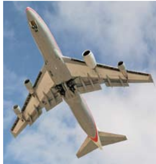
GE-Aviation has filed the GENx under GE's "ecomagination" product portfolio, which the company defines as its commitment to develop new, cost-effective technologies that enhance customers' environmental and operating performance.

Three Pratt & Whitney JT8s are what make up the rest of the testbed engines, which came with the aircraft when GE bought it used. GE says the testbed is one of the last of that early model of 747 that is still in service, and it was designed for the JT8. At one time, GE considered replacing the engines with its