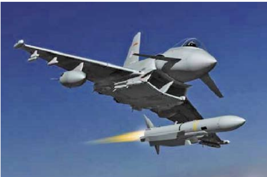
Typhoon will be equipped with the new Meteor missile, but Tornado is being engineered to carry out trials.