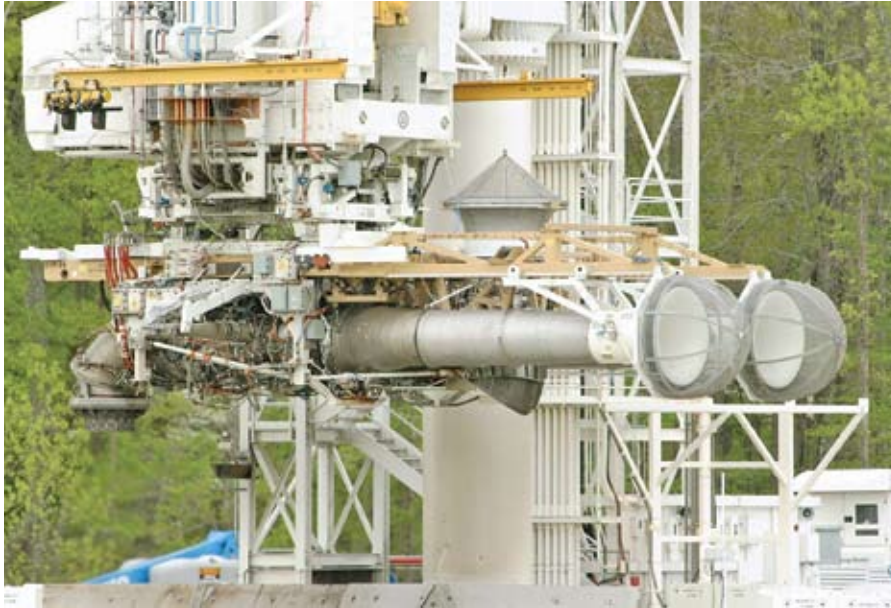
The F136 engine for the F-35 Lightning II is undergoing a rigorous testing program.