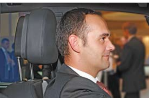
Optimum safety is a question of millimeters, the supplier says: The optimum distance between headrest and head is roughly four-fifths of an inch.

based on contour detection, according to Brose. However, this can lead to incorrect adjustment caused by the shape of hats or voluminous hairstyles, the supplier claims. To avoid such influences, Brose has integrated a capacitive proximity sensor and two antennas plus compact control electronics in the headrest. When a person sits down in the car's seat, the head functions like an electrode that weakens the electric field above the sensor.