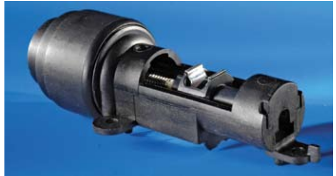
Sonceboz' compact linear actuators are used in bend lighting systems.

To drive automotive actuators such as diesel throttles or exhaust gas recirculation valves, or to adjust the turbine blades within variable turbine geometry turbo-