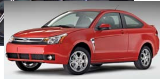
The redesigned Focus is the first of 12 Ford vehicles that will employ Sync, which lets drivers control MP3 players and phones with voice commands.

ward, we'll continue to make significant investments."