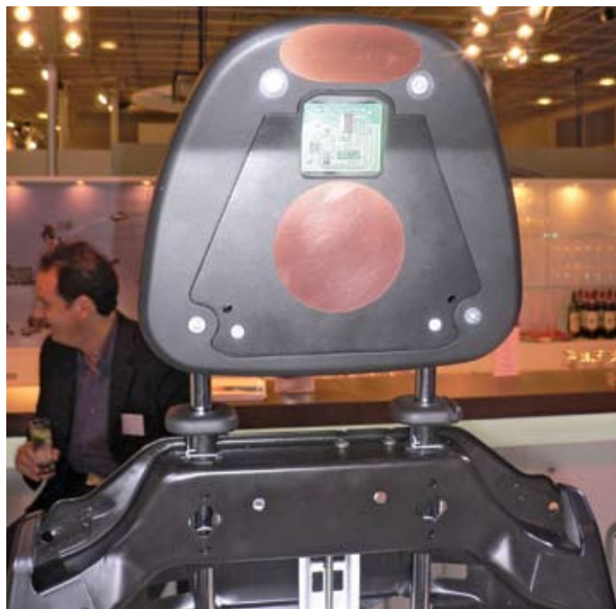
Brose showed its four-way sensor-controlled headrest adjuster system for the first time at the Frankfurt Motor Show. A sensor detects occupant head position by measuring its effect on an electric field.