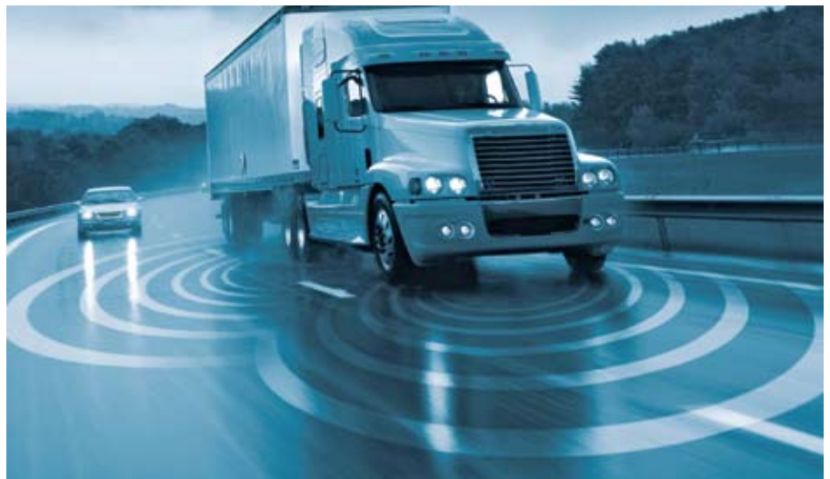
Features available with Eaton's next-generation VORAD VS-400 safety system include standard collision warning with forward-looking radar, BlindSpotter side sensor, and SmartCruise adaptive cruise control.

VORAD's collision warning system is designed to help drivers take evasive action before accidents occur by emphasizing safe following distances and warning them of potential hazards ahead. Incorporating both audio and visual warning signals, the system alerts drivers to such hazards as a stopped or slow moving vehicle up to 500 ft (152 m) ahead, even around curves. The system also helps drivers navigate safely through adverse weather conditions such as fog, snow, dust, and heavy rain, and provides