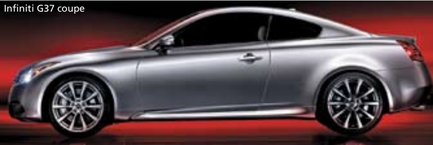
Infiniti G37 coupe

3.7-L V6 compared with the previous 3.5-L engine.