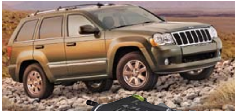
Jeep Grand Cherokee and 4.7-L V8

The New Venture Gear -supplied transfer cases for the two available four-wheel-drive systems (Command-Trac and Selec-Trac II) feature reduced internal friction, contributing to a 1 mpg improvement in fuel economy even though the available engines are unchanged. This improvement will not be apparent to customers because of the tougher EPA test for 2008 model year vehicles, but it will still leave the Liberty in a better position