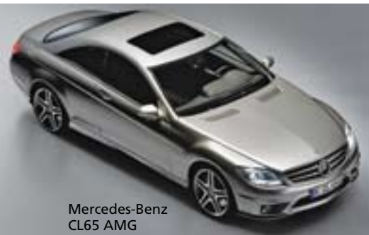
Mercedes-Benz CL65 AMG