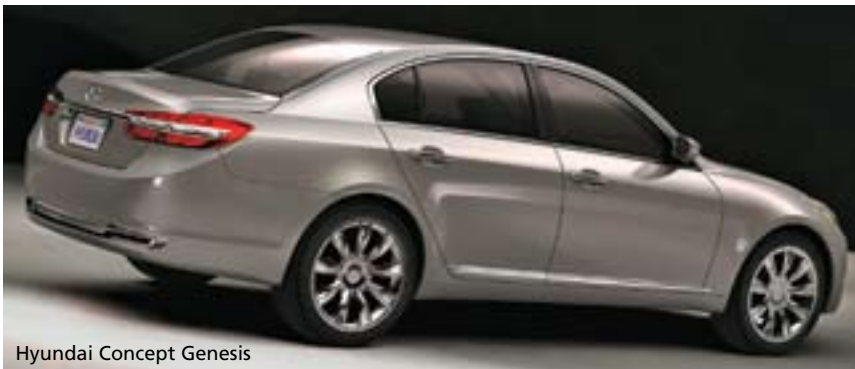
Hyundai Concept Genesis

The joke among media at the NY show was that, if you were looking for executives and designers from any automaker, just go to the Hyundai stand. Its Concept Genesis debut was the show's most anticipated introduction. The rear-drive V8-powered concept was displayed in close-to-production sheet metal, without an interior.