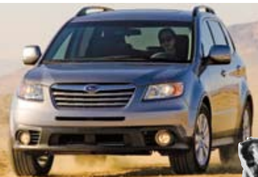
Subaru Tribeca and 3.6-L flat six

caliper per wheel. Their stopping performance results in an astounding 60-0 mph (97-0 km/h) stop of 116 ft (35.4 m) for the 4599-lb (2086-kg) car.