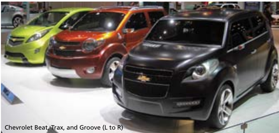
Chevrolet Beat, Trax, and Groove (L to R)