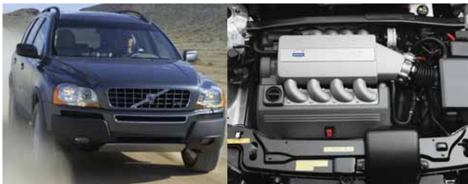
Volvo XC90 and V8 engine

adjustable for height and reach. A little more space has been found in the cockpit, and taller drivers will now find sufficient adjustment.