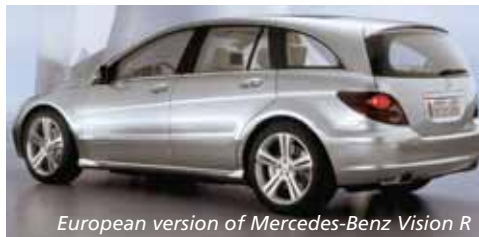
European version of Mercedes-Benz Vision R

a new model line with its four-door coupe CLS Class, but has also given the lexicologists something to ponder. What does not need any pondering is the likely success of the CLS, production of which is scheduled to reach at least 30,000 units next year. Shown as a concept at Frankfurt in 2003, it took less than a year from then to see it into production, which says much for Mercedes' adroit development but also underlines the fact that the company was convinced of its potential well before Frankfurt. Making extensive use of E-Class mechanicals worked wonders for the reduced lead time.