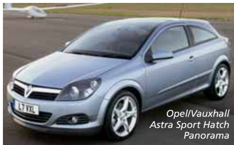
Opel/Vauxhall Astra Sport Hatch Panorama

fixed axis while the passenger side wiper executes an "additional lifting movement" to wipe an even larger area of the windshield. The system is described as using a reversing motor that periodically changes its direction of rotation, so driving the wipers on the reverse sweep. This means that the wiping frequency and intervals can be continuously varied according to need, either manually or with the help of the standard rain sensor. The wipers comprise a one-piece rubber section with an integral spoiler and externally mounted spring rails. Mercedes says this configuration brings better wiping quality and reduced noise.