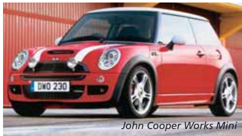
John Cooper Works Mini