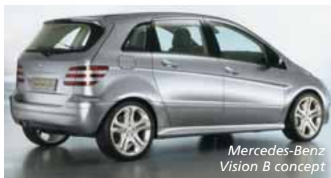
Mercedes-Benz Vision B concept