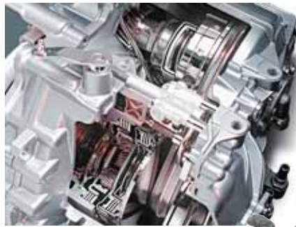
Ford Focus Duratec Ti-VCT and CVT detail

MSC.Dytran™ Explicit nonlinear analysis of crash, explosions, fluid structure interaction and high speed events