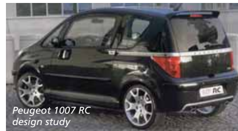
Peugeot 1007 RC design study

shorter and stiffer coil springs to lower ride height, with a new cross-brace in the engine compartment to reduce body vibration. A sports brake system includes larger discs. All accessories have been fully developed jointly by Cooper and Mini engineers. Cosmetic options include carbon-fiber interior trim items.