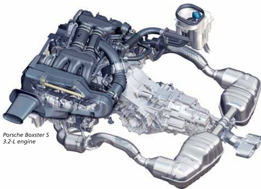
Porsche Boxster S 3.2-L engine

Continuous Damping Control (CDC) and steering-linked AFL (Adaptive Forward Lighting) headlamps.