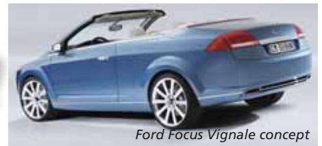
Ford Focus Vignale concept