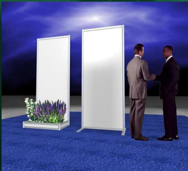
One Meter x 8ft. stand-alone units with optional flower box.