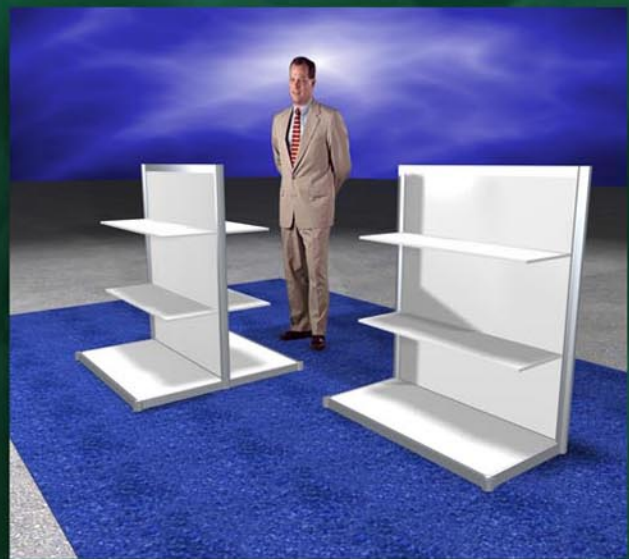
42" High Gondola Displays Single or Double-Sided