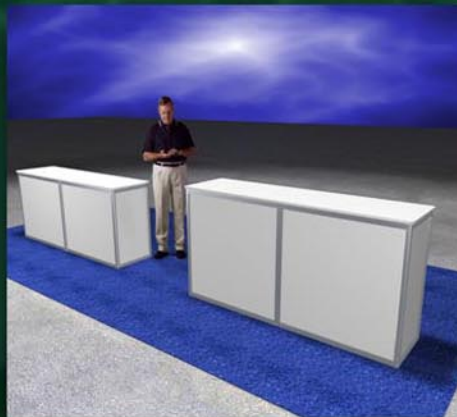
Two Meter wide - 30" & 43" high with sliding doors