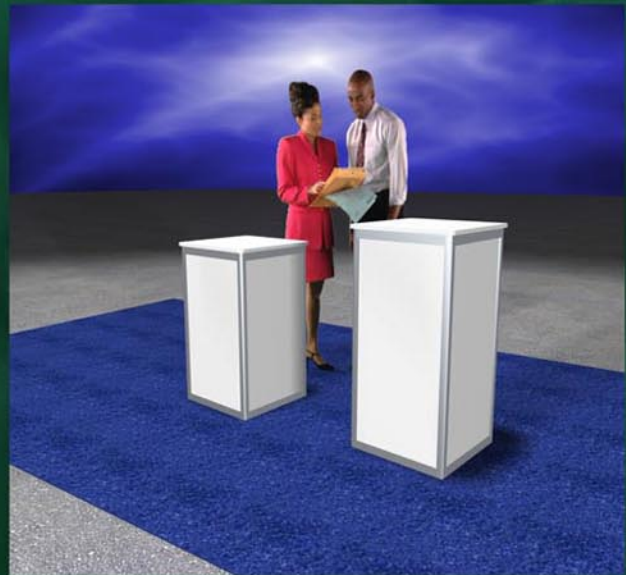
Display Pedestals 30" and 43"