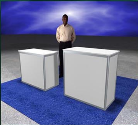
One Meter wide - 30" & 43" high with sliding doors