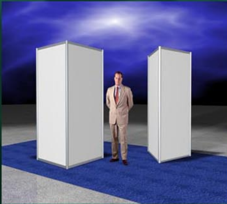
One Meter x 8ft. square or triangular towers.