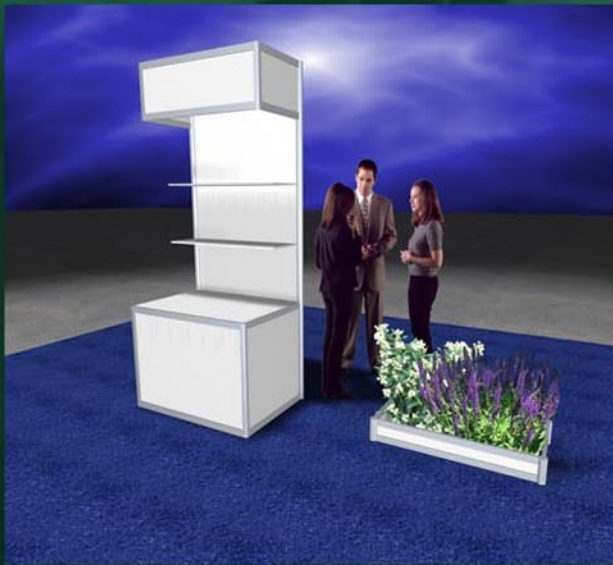
Shelf Cabinet Units & Flower Box