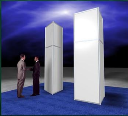
One Meter x 12ft. square or triangular towers.