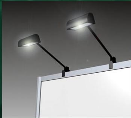
Halogen arm lights