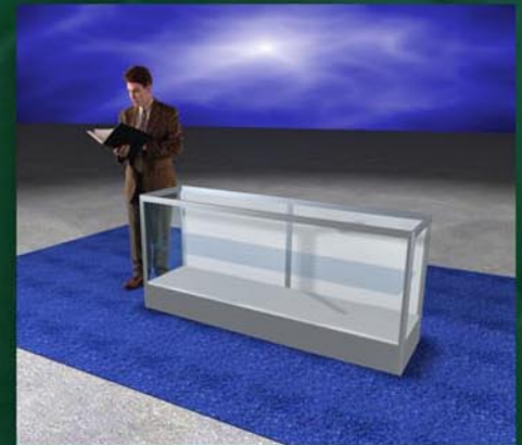
Full view showcase