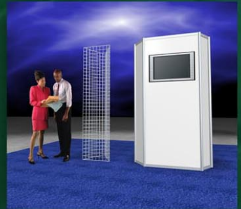
Wirewall and TV/DVD/VCR cabinet kiosks.