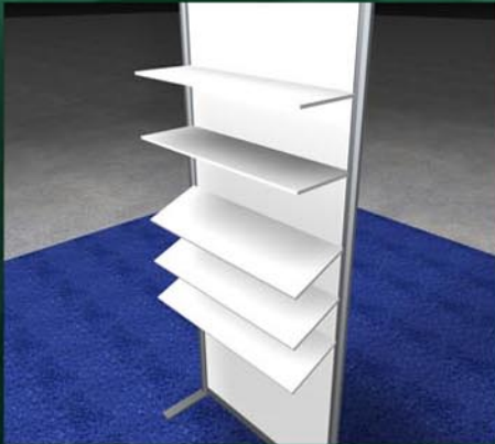
Straight and angled shelves