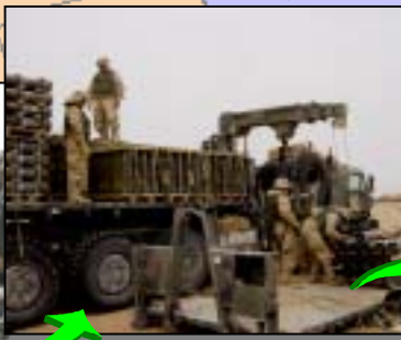
To the Warfighter in the field