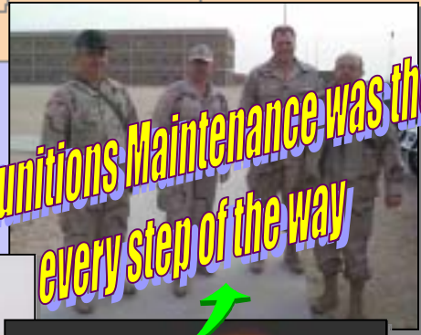
AMC Munitions Maintenance was there every step of the way