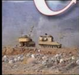
TOWED & SELF-PROPELLED ARTILLERY