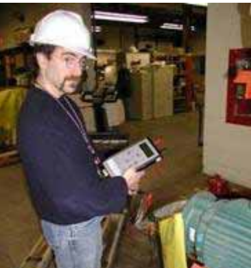
Motor Circuit Analysis