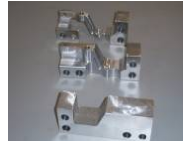
T-38 Aileron Lever