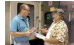
Tinker AFB--Numerical control programmer and machinist discuss the T-38 project while a milling machine behind them precisely carves a T-38 left aileron actuator lever from raw material.

Rapid Inspection and Manufacturing Capabilities