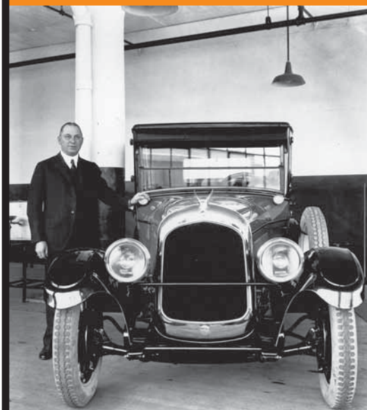
"There is a joy in engineering that only poets are supposed to know," said Walter P. Chrysler.