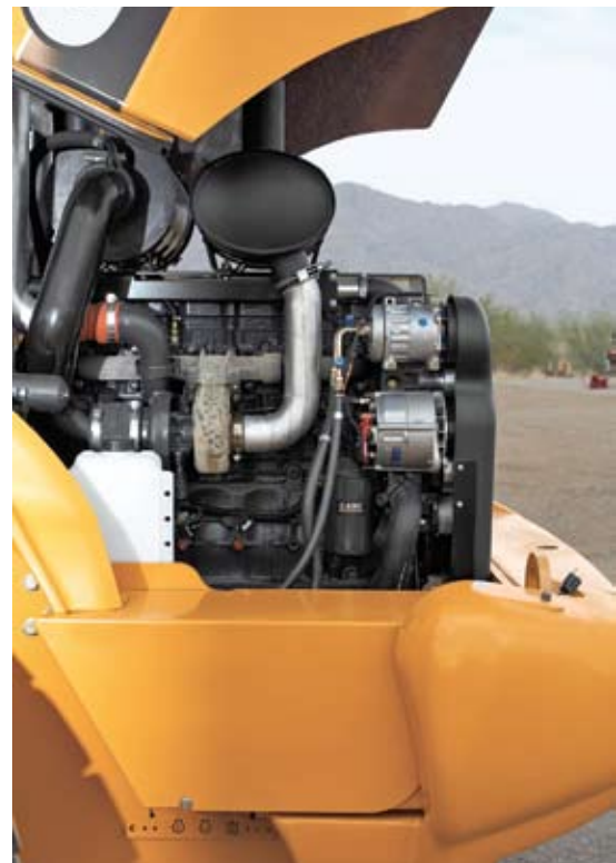
A one-piece electric lift hood gives operators and technicians easy access to the entire engine area.

Limited-slip axles, standard on the 621E, improve traction