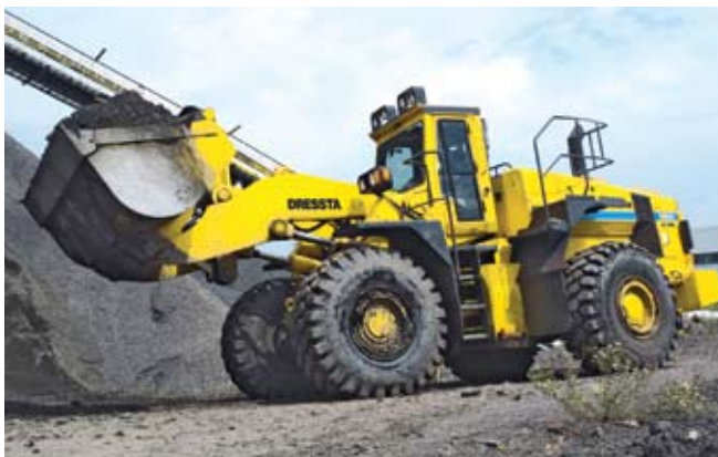
Dressta's newest wheel loader, the 555C Extra, features a turbocharged 10.8-L diesel engine, electrically controlled countershaft transmission, hydrostatic steering, and single-lever hydraulic controls.

This machine's articulating frame provides articulation of 40° to the right or left and a tight 21.3-ft (6.5-m) turning radius. The 5264-lb (2388-kg) counterweight is standard. Heavy-duty axles incorporate full-floating axle shafts and a planetary final drive.