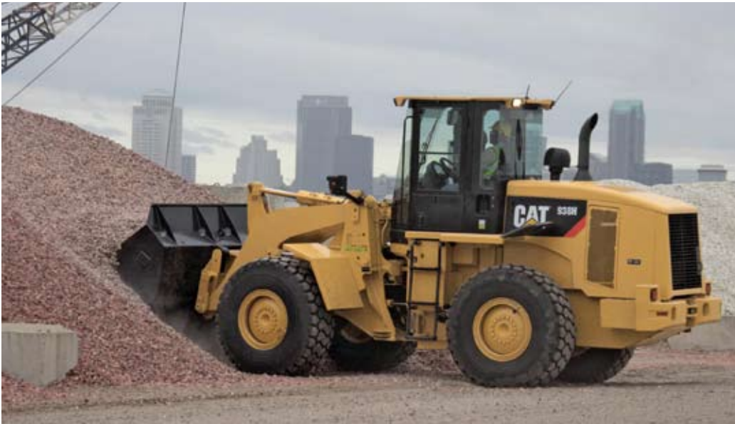
Caterpillar's new 938H wheel loader features differential lock for both axles and load-sensing, variable-flow hydraulics for dependable tractive effort, increased rimpull into the pile, and a 16% increase in lift force compared to the previous models, according to Cat.

Equipped with the company's own ACERT technology, the C6.6 engine's cylinder head incorporates a new cross-flow design that facilitates air movement, and the turbocharger is equipped with a 'smart' waste gate that provides precise, reli-