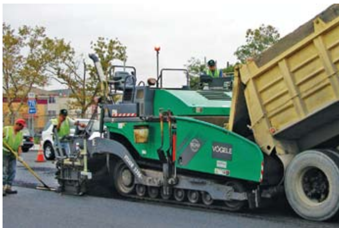
Vögele America's new Vision Series asphalt pavers include the tracked Vision 5200-2 (left) and the wheeled Vision 5203-2 (right).

Vision Series pavers are powered by a six-cylinder Cummins engine that provides 240 hp (179 kW) at 2000 rpm. Operator-selectable speed ranges—MIN, ECO Mode, and MAX—can be chosen based on power, fuel consumption, and noise level requirements.