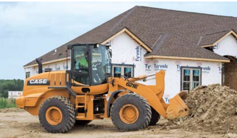
The new Case 621E wheel loader offers three power curves and four work modes so operators can balance fuel economy with power demand based on the application.

Visibility has been maximized both forward and rear with floor-to-ceiling glass in the front and a sloping rear engine compartment, which also helps to increase visibility to the attachment and work site. The cab features strategically located air diffusers for maximum air circulation and faster,