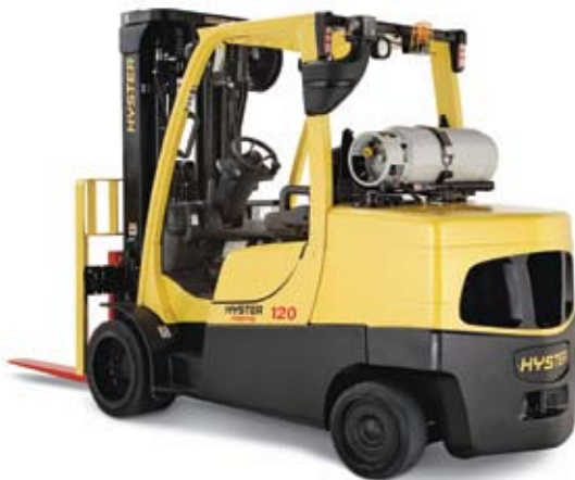
Available in cushion tire and pneumatic tire configurations, Hyster's S80-120FT and H80-120FT Fortis sit-down counterbalanced lift trucks can be tailored to a specific application and work environment with the selection of one of three preconfigured powertrain bundles.

Hyster's upgraded S80-120FT and H80-120FT lines of sit-down, counterbalanced lift trucks combine a robust powertrain with industrial-strength hydraulics, a re-engineered cooling system, and ergonomic features. According to Hyster, the Fortis line's advanced features allow operators to decrease downtime by as much as 30%.