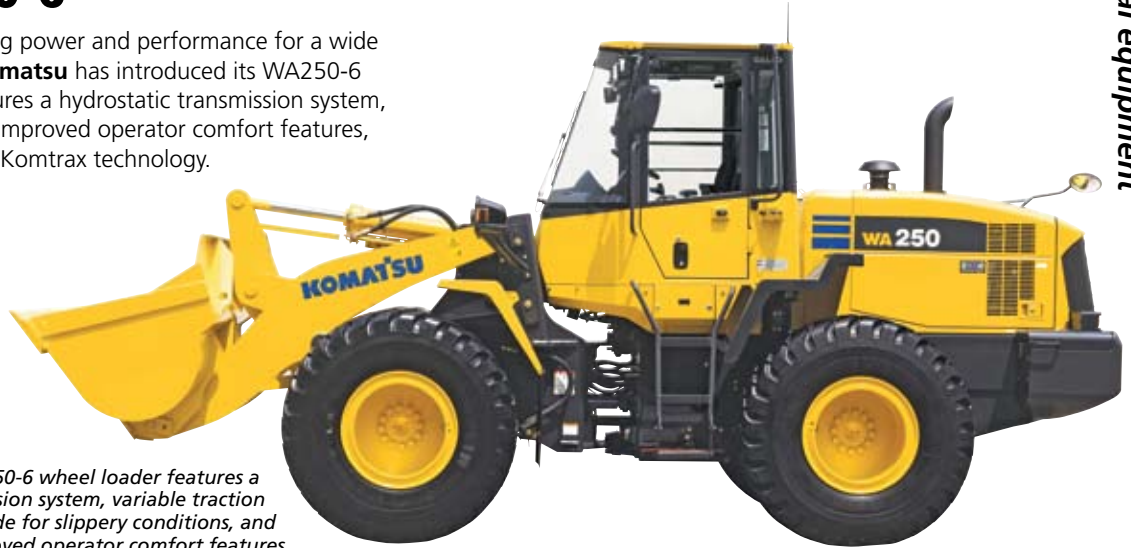
Komatsu's new WA250-6 wheel loader features a hydrostatic transmission system, variable traction control with S mode for slippery conditions, and improved operator comfort features.

Boasting increased loading power and performance for a wide range of applications, Komatsu has introduced its WA250-6 wheel loader, which features a hydrostatic transmission system, variable traction control, improved operator comfort features, and the company's latest Komtrax technology.