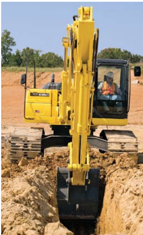
Four power modes on Kobelco's new excavator allow the operator to match power to the specific work task and conditions.