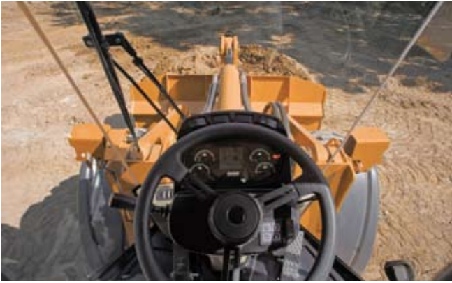
Floor-to-ceiling glass in the front, along with a sloping rear engine compartment, gives the operator a panoramic view, with maximum visibility both forward and to the rear.

more-thorough heating and cooling, plus a thermal box that keeps food and beverages hot or cold, during long hours of operation.