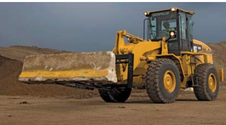
Cat's IT38H integrated toolcarrier and 938H wheel loader are both powered by a new 6.6-L diesel engine that features a new cross-flow cylinder head design and a smart waste gate turbocharger that provides precise, reliable control of the boost pressure.

able control of the boost pressure. ADEM A4, Cat's engine management electronic control module, monitors engine conditions and regulates fuel delivery and other parameters to manage load and performance. An engine idle management system maximizes fuel efficiency and offers four idle control speeds to meet application requirements. To feed the common fuel rail, the engine employs an oil-lubricated high-pressure fuel pump that has been designed to be tolerant of alternative fuels.