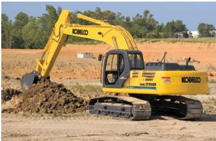
Kobelco Construction Machinery America's new SK260LC Acera Mark 8 excavator features an intelligent total control system that provides smooth hydraulic response based on the operator's moves.