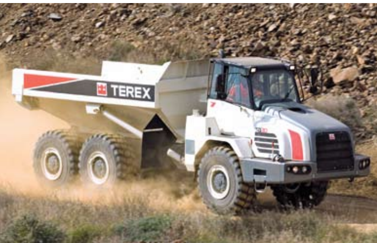
The re-engineered Terex TA30 features an independent suspension system that provides a comfortable ride across a wide range of operating terrains.

The TA30 is powered by a six-cylinder, 10.8-L Cummins QSM11 diesel engine that is certified to U.S. EPA Tier 3 and EU (non-road mobile machinery directive) Stage III. Turbocharged with air-to-air cooling, the engine delivers 333 net hp (248 kW) and 1310 lb-ft (1776 N-m) at 1400 rpm. A modulating fan reduces noise level and consumes engine power only when cooling is needed.