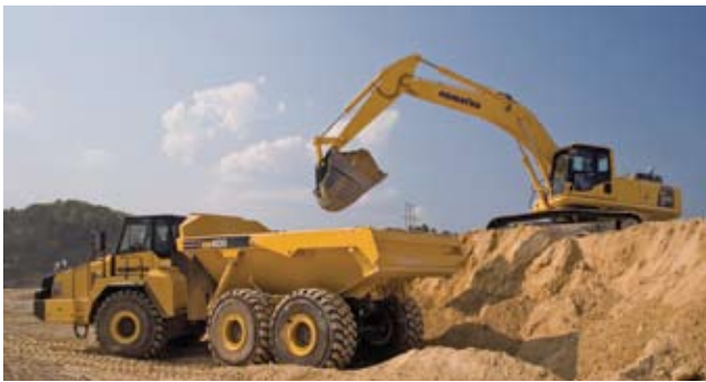
Komatsu America's new PC300LC-8 and PC300HD-8 hydraulic excavators offer five working modes, two boom mode settings, and a Power Max Function that increases digging force by 7% for 8.5 s.