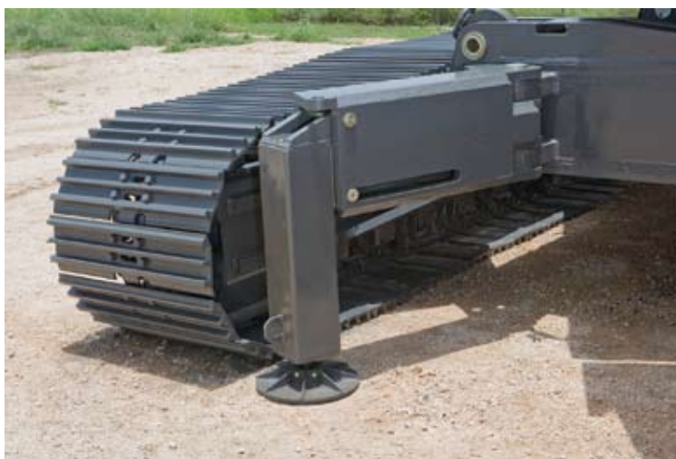
The Volvo pipelayer's wider gauge, lower center of gravity, and boom mounting inboard of the track frame provide the stability to work on slopes with much higher lift capacities than conventional equipment.