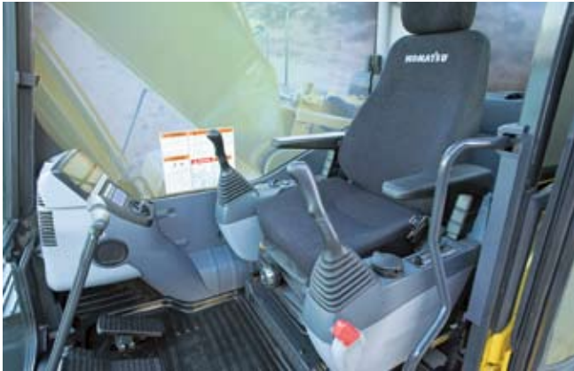
Both excavators feature a new pressurized and viscous-mounted cab with a high-back operator seat and multi-position, pressure-proportional control levers and armrests.

A new easy-to-view, 7-in LCD monitor displays operating modes, air-conditioner status, machine maintenance tracking, and the image from a standard, counterweight-mounted rearview camera system.