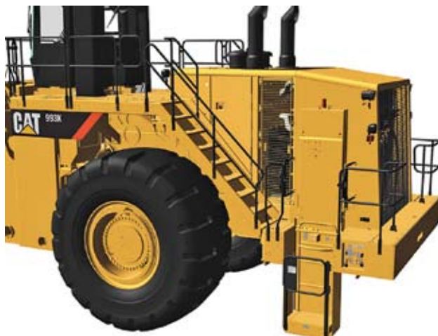
The 993K's optional Rear Access Egress System can lift the operator to and from the cab.

Designed to support key Cat off-highway trucks, the 50,000-lb (22,700-kg) loader capacity is four-pass matched to the Cat 777 and six-pass matched to the Cat 785. Because these trucks can represent a bottleneck for most projects, the 993K's ability to load them in just four or six passes can help many jobsites achieve a new level of productivity.