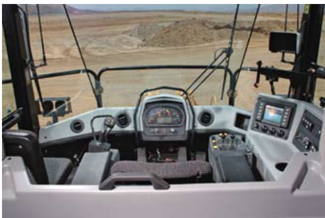
The 993K's cab is 14% larger than the previous model's, with more room for the operator as well as a trainer seat.