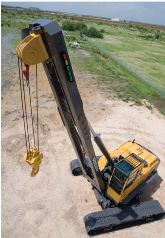
Volvo Construction Equipment is introducing a new product class of pipelaying machines that combine lifting performance with the 360°-swing functionality of an excavator.

An onboard load management system (LMS) enables the operator to better determine what can be safely picked up depending on the angle of the boom, the cab's position relative to the tracks, and the incline on which the machine is operating. Load charts are constantly updated for 360°-rotation and