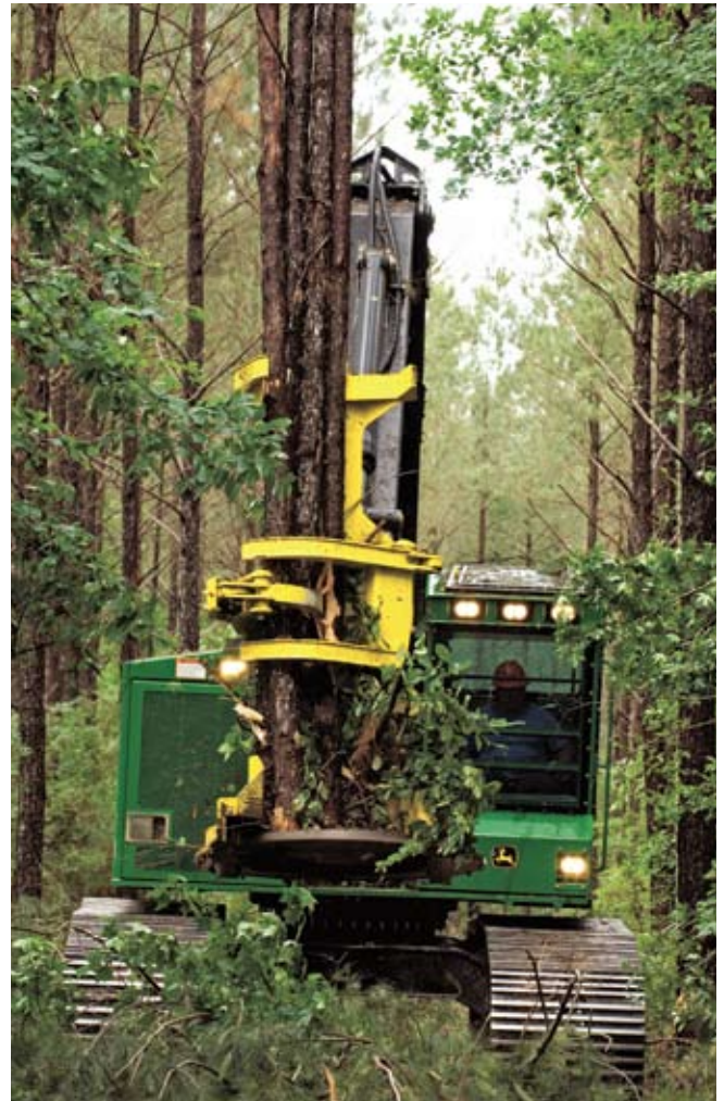
Deere's new 700J Series track feller bunchers feature a load-managing system that can prioritize hydraulic flow according to demand, providing up to 17% higher flow to the feller attachment compared to previous models.

Phone 231-879-3372 Fax 231-879-4330 Catalog Request info@hayescouplings.com Check us out on the web: www.hayescouplings.com