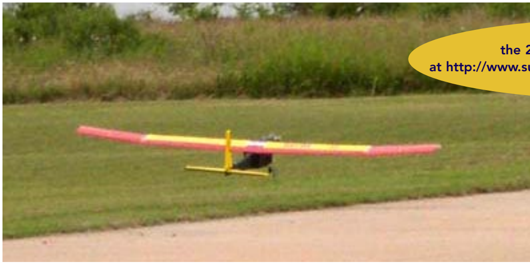
Kansas State University

Don't forget to complete the 2004 Aero Design West survey at http://www.surveymonkey.com/s.asp?u=22140501833