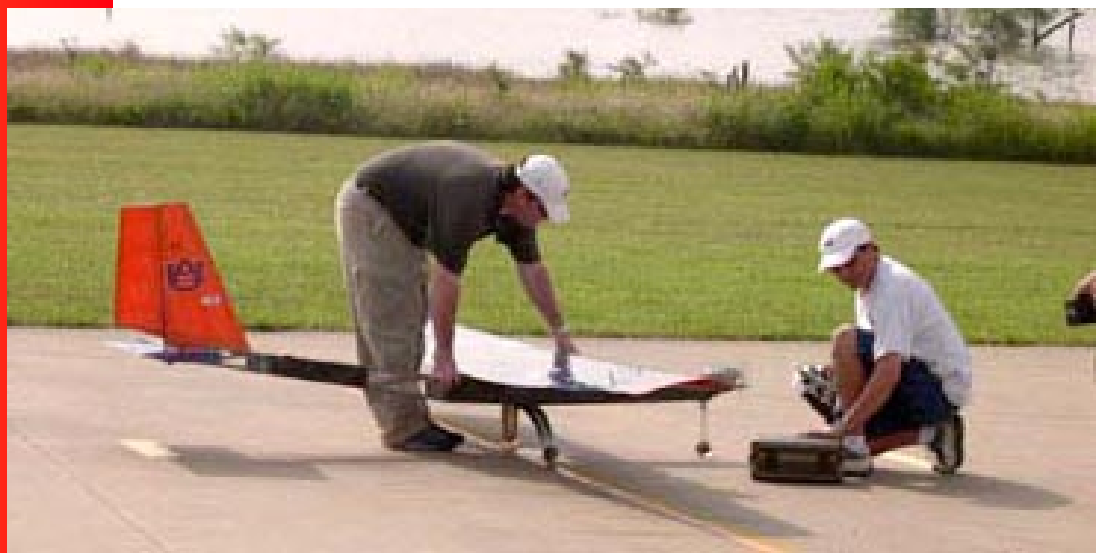
Auburn University Second place - Regular Class

Rounding out the top three is Ecole de technologie superieure (ETS), ACE, with a score of 238.6635. ETS also lifted the most weight, 35.96 lbs. In April, ACE placed third overall at Aero Design East.