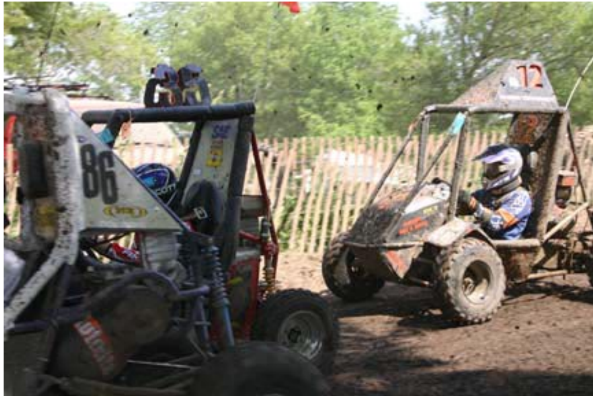
Auburn University #12 during the endurance race.

For more information on the final scores, please visit http://www.sae.org/students/mbereslt.htm under 2004 results.