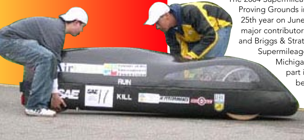
UBC - First place Overall

The 2004 Supermileage competition was held at the Eaton Proving Grounds in Marshall, Michigan to celebrate its 25th year on June 11 & 12th. Two corporations have been major contributors to Supermileage; Eaton Corporation and Briggs & Stratton. This year is no exception. In addition, Supermileage has been supported by the SAE Western Michigan Section which has played an integral part in supporting the competition from the beginning into the present.