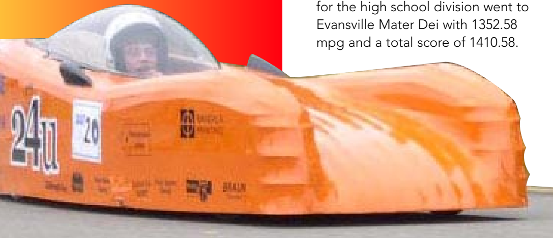
Winamac high School

Supermileage is the only SAE competition that includes high school teams. The 2004 first place trophy for the high school division went to Evansville Mater Dei with 1352.58 mpg and a total score of 1410.58.