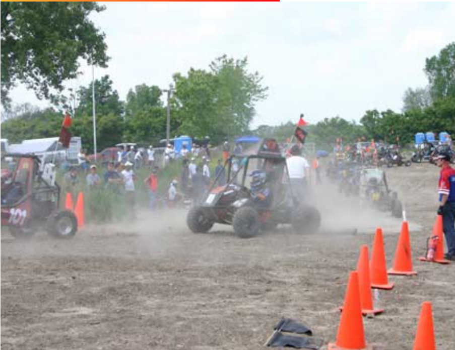
Start of the endurance race

inspection, design, acceleration and braking, skid pull, hill climb, maneuverability, and the endurance events.