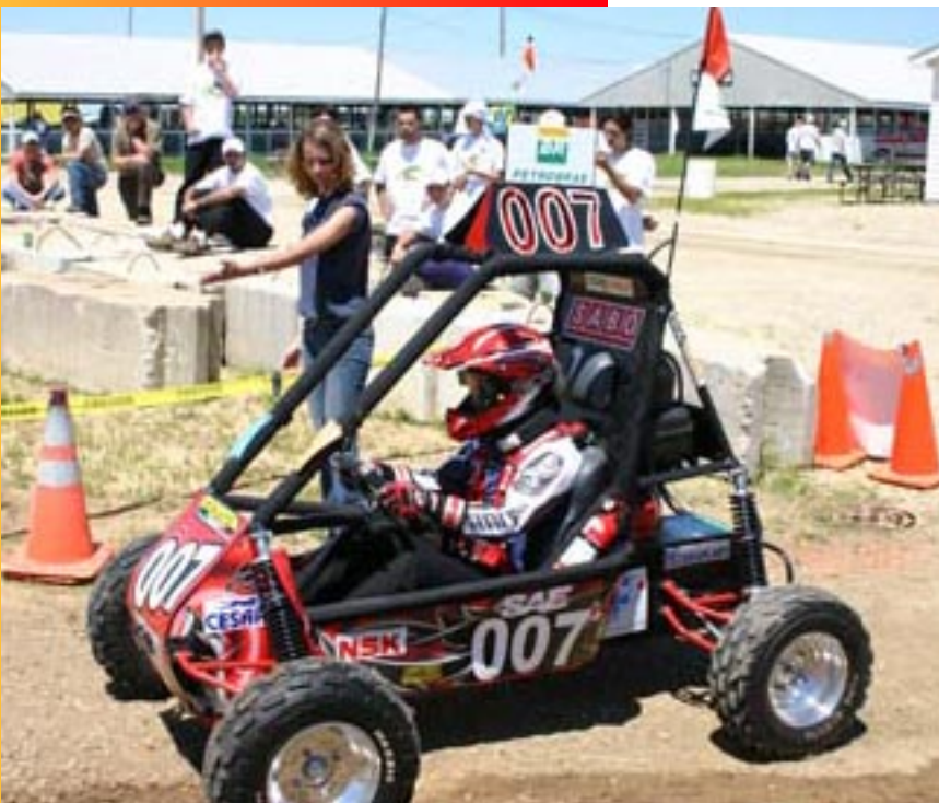
Brazil #7 First place overall

Judges and volunteers from major Mini Baja sponsors - Briggs & Stratton, Honda, Polaris and SAE Milwaukee Section members evaluated the teams as they passed through technical