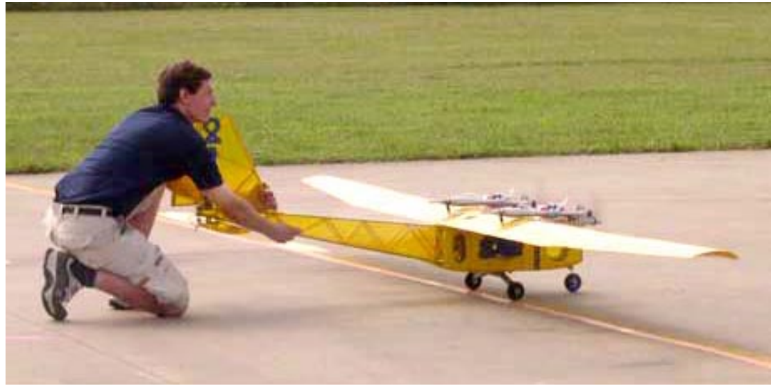
University of Akron First place - Open Class

Trailing by only a few points was the University of Missouri-Rolla. They scored 162.0339 points and also lifted the most weight for Open Class with 56.56 lbs. Third place overall was the team from the University of British Columbia with a total score of 110.2805.