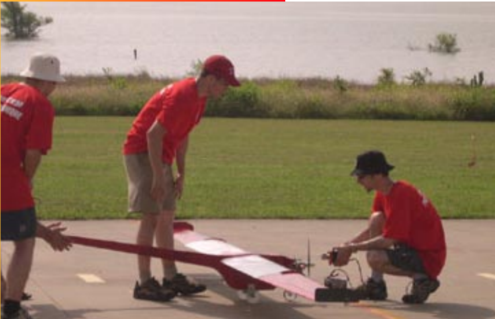
Ecole. Poly de Montreal First place - Regular Class