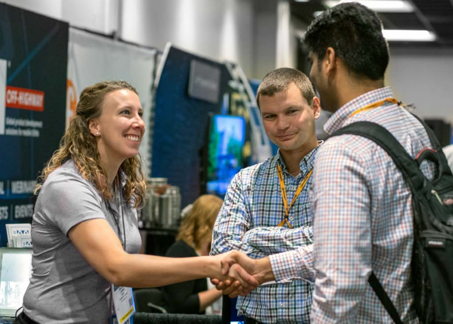
EXHIBIT BOOTH PRICING

$4,000 per standard 10'x10' exhibit space + $250 per exposed corner